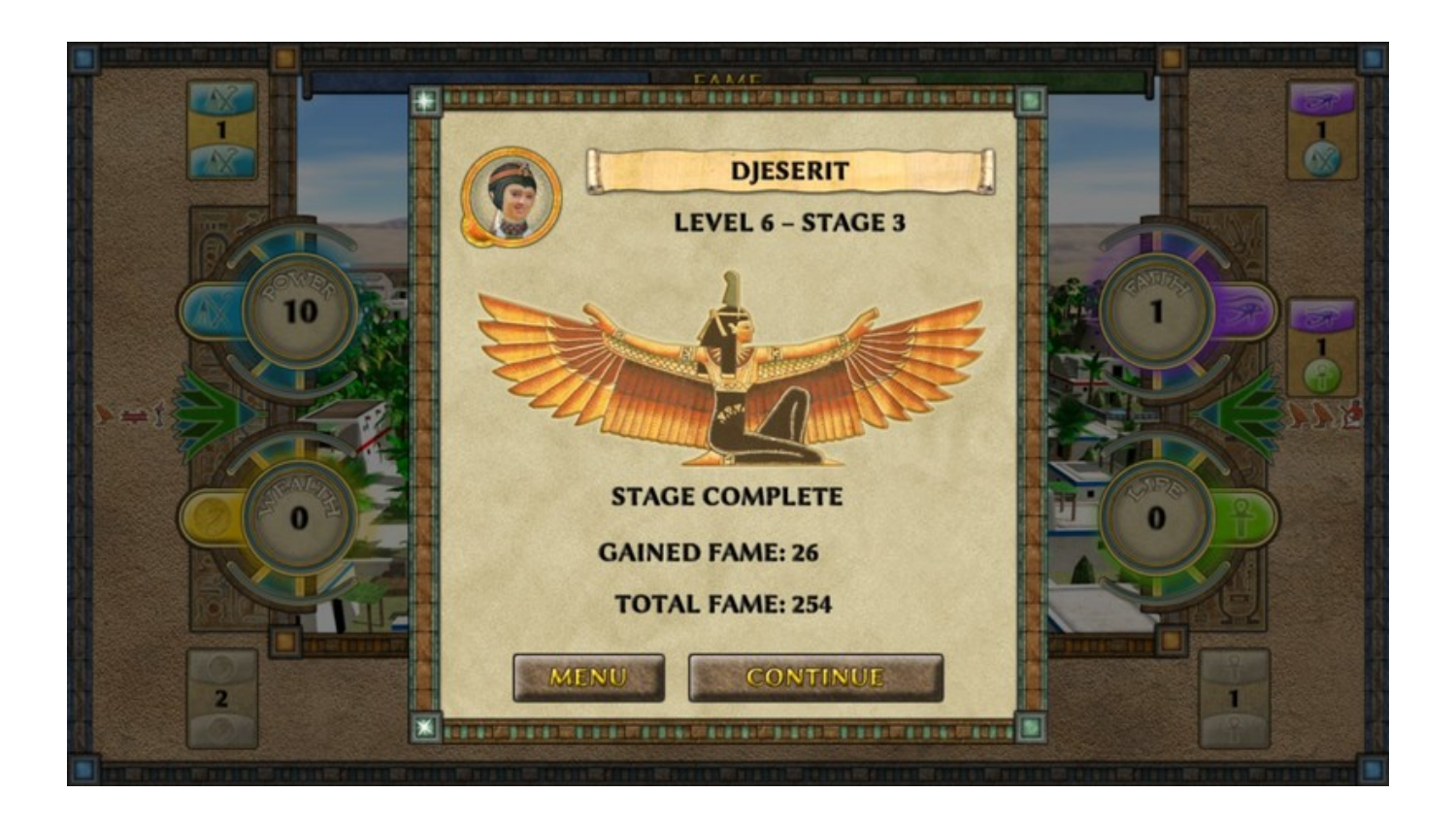
Empire Of The Gods Mod Download

Download >>> <a href="http://bit.ly/2SJrcnK">http://bit.ly/2SJrcnK</a>